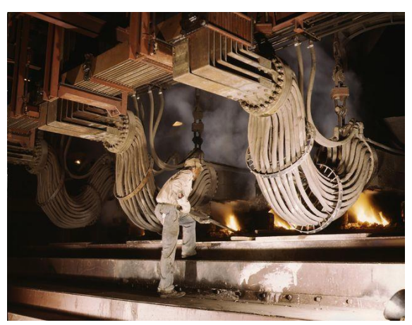
Figure 4. TVA phosphate smelting furnace

It has been instrumental in the production of iron and steel for centuries.