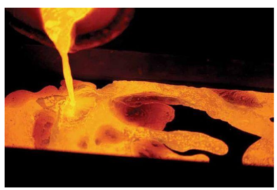
Figure 3. Metallurgy