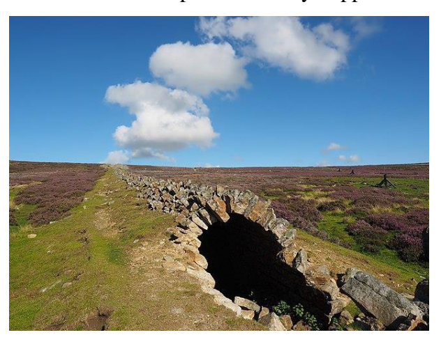
Figure 8. Ruins of the Grinton Smelting Mill Flue, from circa 1820.

As sustainability becomes an increasingly important focus in the steel sector, ongoing efforts to minimize water consumption, improve recycling practices, and implement advanced water treatment technologies will continue to shape the industry's approach to water management.