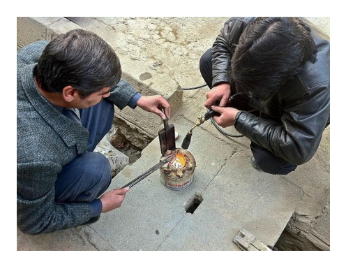
Figure 7. Wikimedia Commons: Low-Tech Smelting of Silver

Silver smelting can also involve pyrometallurgical processes.