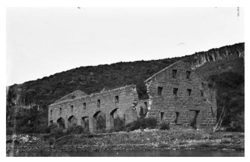
Figure 1. Old House