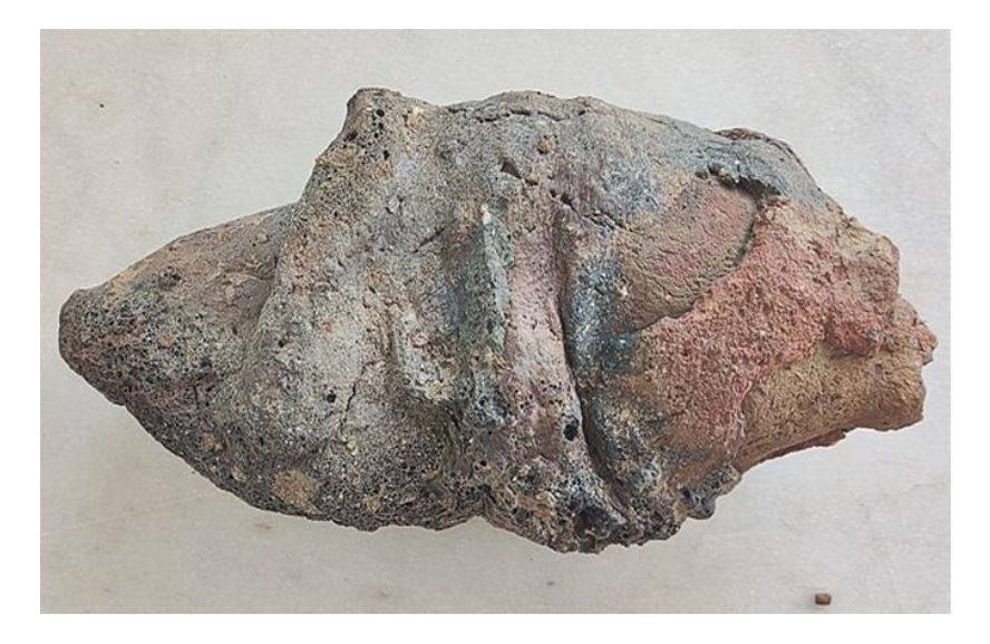
Figure 2. Ancient Retort

An ancient retort (see image above), used in ancient smelting processes, served several important purposes: