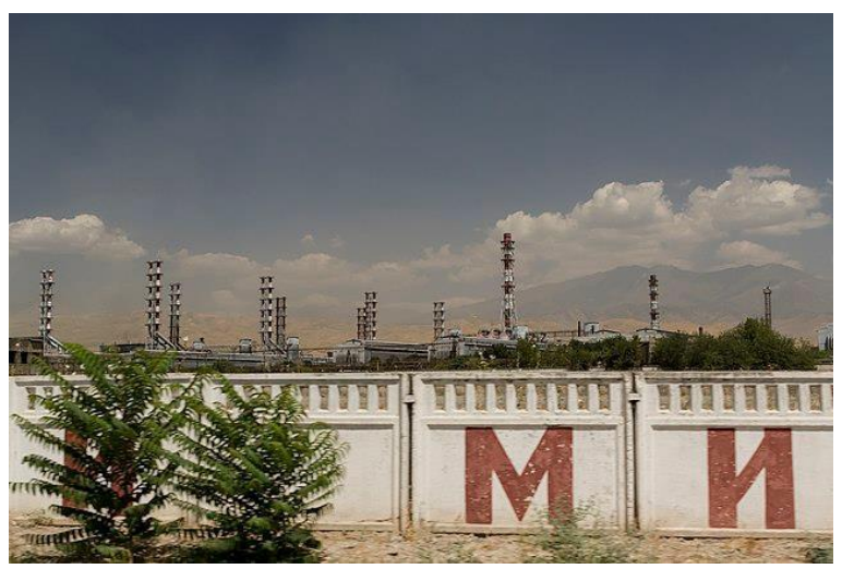
Figure 6. Aluminium smelting plant, Tursunzoda, Tajikistan

The primary method used for aluminum smelting is the Hall-Héroult process, which is an electrochemical reduction process.